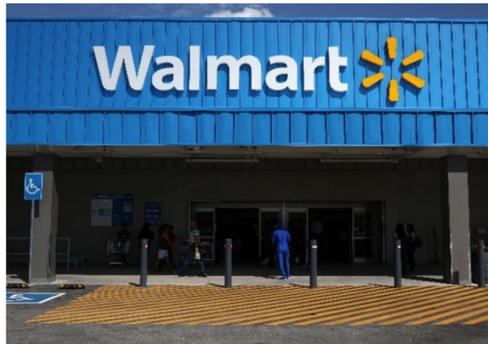
Its teams at Walmart Labs India, are using technology to deliver leading-edge innovations for the retailer